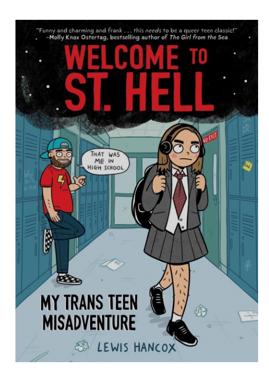
Young Adult Graphic Novel